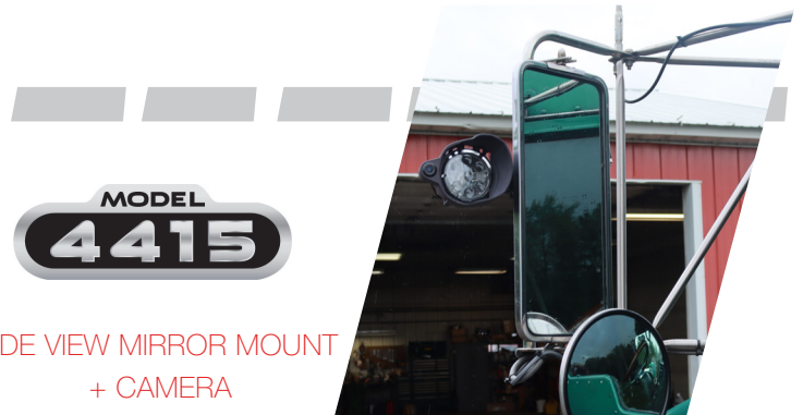
SIDE VIEW MIRROR MOUNT + CAMERA

▲ WARNING: Cancer and Reproductive Harm - www.P65Warnings.ca.gov ▲ AVERTISSEMENT: Cancer et effet nocif sur la reproduction - www.P65Warnings.ca.gov