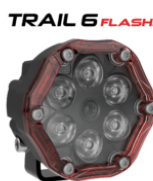
Part Number 8200553 Appearance Kit - RED