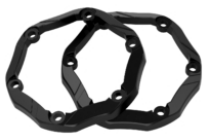
Part Number 8200543 APPEARANCE KIT - BLACK