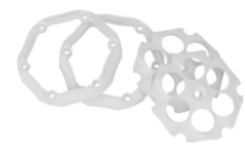
Part Number 8200563 Appearance Kit - White ABS