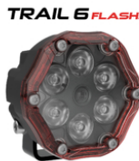
Part Number 8200553 Appearance Kit - RED