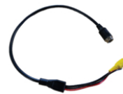
Part Number 3271571 M12-RCA CONVERSION CABLE