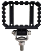
Part Number 8201031 Pedestal Mount Kit for Mosaic