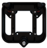
Part Number 8200831 Mounting Hardware Kit for Mosaic