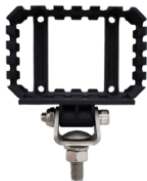
Part Number 8201031 Pedestal Mount Kit for Mosaic