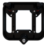
Part Number 8201041 Tall Mounting Hardware Kit for Mosaic