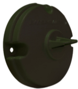
Part Number 0556142 12-24V 117mm Cyan Blackout Driving Light with Green Housing - Bulk Qty (24 MIN)