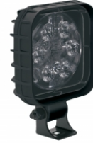
Part Number 1300041

12-24V LED Work Light with Spot Beam Pattern