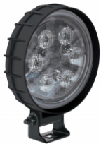
Part Number 1403241 12-24V Non-Heated LED Work Light with Flood Beam Pattern