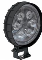
Part Number 1403261 12-24V Non-Heated LED Work Light with Spot Beam Pattern