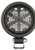
Part Number 1403471 12-24V LED Heated Work Light with Flood Beam Pattern