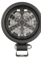
Part Number 1403481 12-24V LED Heated Work Light with Spot Beam Pattern