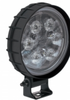
Part Number 1403271 12-110V Non-Heated LED Work Light with Trapezoid Beam Pattern