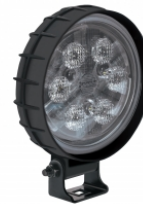
Part Number 1403281 12-110V Non-Heated LED Work Light with Spot Beam Pattern