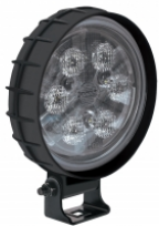
Part Number 1403291 12-110V Non-Heated LED Work Light with Flood Beam Pattern