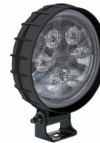
Part Number 1403281 12-110V Non-Heated LED Work Light with Spot Beam Pattern