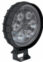
Part Number 1403251 12-24V Non-Heated LED Work Light with Trapezoid Beam Pattern