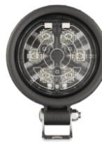
Part Number 1403481 12-24V LED Heated Work Light with Spot Beam Pattern