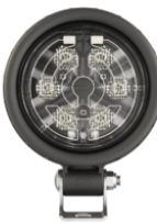
Part Number 1403471 12-24V LED Heated Work Light with Flood Beam Pattern