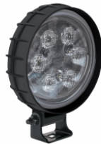
Part Number 1403261 12-24V Non-Heated LED Work Light with Spot Beam Pattern