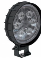
Part Number 1403271 12-110V Non-Heated LED Work Light with Trapezoid Beam Pattern