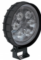
Part Number 1403251 12-24V Non-Heated LED Work Light with Trapezoid Beam Pattern