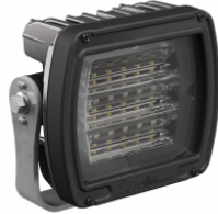
Part Number 1300601 24V Anti-Glare Beam Pattern w/ Polycarbonate Lens