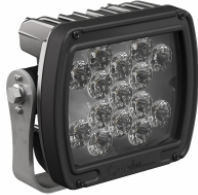
Part Number 1300591 24V LED Work Light with Black Housing, Polycarbonate Lens & Trapezoid Beam Pattern