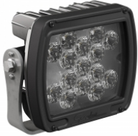
Part Number 1300581 24V LED Work Light with Black Housing, Polycarbonate Lens & Flood Beam Pattern