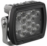
Part Number 1300721 12V LED Work Light with Black Housing, Polycarbonate Lens & Flood Beam Pattern