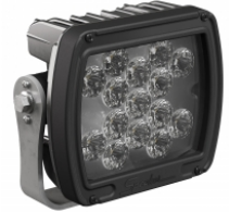
Part Number 1300701 12V LED Work Light with Black Housing, Polycarbonate Lens & Spot Beam Pattern