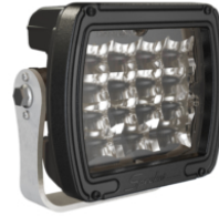
Part Number 1300641 24V LED Work Light with Black Housing, Polycarbonate Lens & Dual White Anti-Glare Pattern