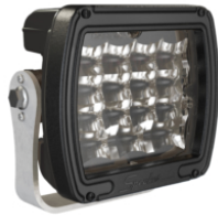
Part Number 1300761 12V LED Work Light with Black Housing, Polycarbonate Lens & Dual White Anti-Glare Pattern