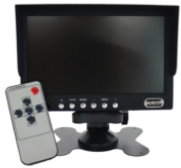
Part Number 6600841 7" Split Screen Monitor