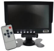
Part Number 6600841 7" Split Screen Monitor