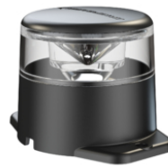
Part Number 0646471 12-80V Blue Class III LED Strobe Light with Flange Mount