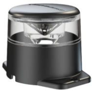
Part Number 0646441 12-80V Amber Class II LED Strobe Light with Flange Mount