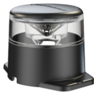
Part Number 0646461 12-80V Green Class III LED Strobe Light with Flange Mount