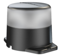
Part Number 0647131 12/80V Red/Green LED Indicator Light with Flange Mount