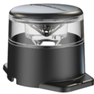
Part Number 0646451 12-80V Red Class III LED Strobe Light with Flange Mount