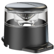
Part Number 0646441 12-80V Amber Class II LED Strobe Light with Flange Mount