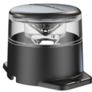
Part Number 0646461 12-80V Green Class III LED Strobe Light with Flange Mount