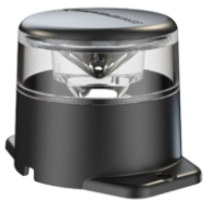
Part Number 0646451 12-80V Red Class III LED Strobe Light with Flange Mount