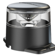
Part Number 0646481 12-80V White Class III LED Strobe Light with Flange Mount