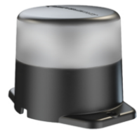
Part Number 0647131 12/80V Red/Green LED Indicator Light with Flange Mount