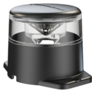
Part Number 0646471 12-80V Blue Class III LED Strobe Light with Flange Mount