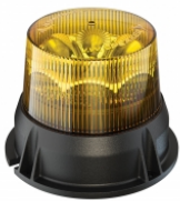
Part Number 0646491 12-80V LED Amber Class I Strobe Light