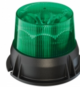
Part Number 0646571 12-80V LED Green Class I Strobe Light