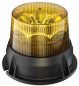
Part Number 0646491 12-80V LED Amber Class I Strobe Light