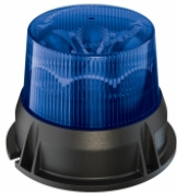
Part Number 0646551 12-80V LED Blue Class I Strobe Light