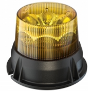
Part Number 0646891 12-80V LED Amber Class I Strobe Light with Magnet Mount