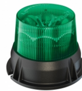
Part Number 0646571 12-80V LED Green Class I Strobe Light