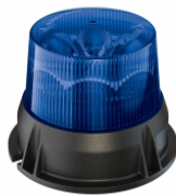
Part Number 0646551 12-80V LED Blue Class I Strobe Light