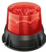
Part Number 0646561 12-80V LED Red Class I Strobe Light