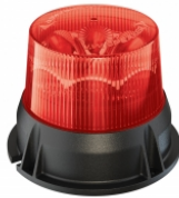
Part Number 0646561 12-80V LED Red Class I Strobe Light