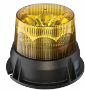
Part Number 0646891 12-80V LED Amber Class I Strobe Light with Magnet Mount