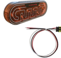
Part Number 0346714 12-24V DOT LED Heated Amber Rear Turn Light with Harness