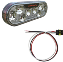
Part Number 0346704 12-24V DOT LED Heated Red Stop, Tail, & Turn Light with Harness