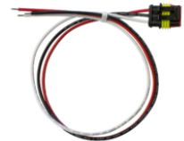
Part Number 3270501 3-Pin AMP Connector Wire Harness Assembly