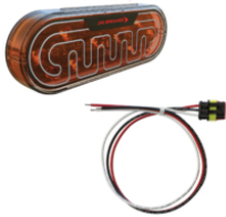
Part Number 0346784 12-24V DOT LED Heated Amber Front Position & Front Turn Signal Light with Harness