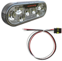
Part Number 0346724 12-24V DOT LED Heated White Reverse Light with Harness