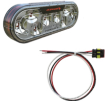
Part Number 0346704 12-24V DOT LED Heated Red Stop, Tail, & Turn Light with Harness