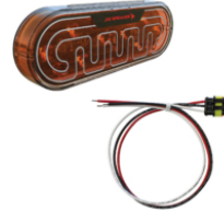
Part Number 0346714 12-24V DOT LED Heated Amber Rear Turn Light with Harness