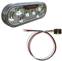
Part Number 0346724 12-24V DOT LED Heated White Reverse Light with Harness