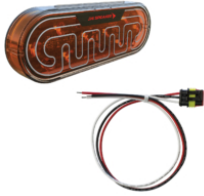
Part Number 0346784 12-24V DOT LED Heated Amber Front Position & Front Turn Signal Light with Harness