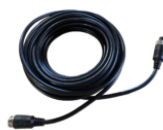
Part Number 3271581 4 PIN M12 CABLE, 6 m