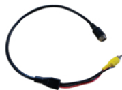
Part Number 3271571 M12-RCA CONVERSION CABLE