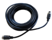
Part Number 3271561 4 PIN M12 CABLE, 10 m