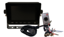
Part Number 6600801 COLOR MONITOR, 5", M12