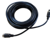
Part Number 3271581 4 PIN M12 CABLE, 6 m