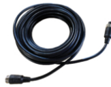
Part Number 3271581 4 PIN M12 CABLE, 6 m