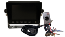
Part Number 6600801 COLOR MONITOR, 5", M12