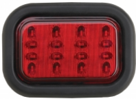
Part Number 0343911 12-24V ECE/SAE LED Stop & Tail Light