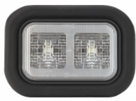
Part Number 0443081 12-24V ECE/SAE LED Backup Light