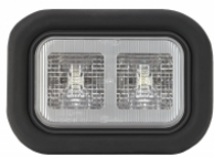
Part Number 0443081 12-24V ECE/SAE LED Backup Light