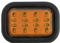
Part Number 0343921 12-24V ECE/SAE LED Turn Signal Light