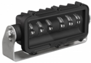
Part Number 0549271 12-24V LED Red Zone Light