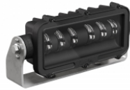
Part Number 0551281 12-24V LED Amber Zone Light