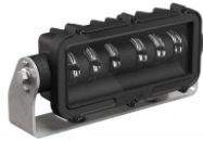
Part Number 0551261 12-24V LED White Zone Light