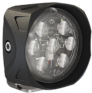
Part Number 0554861 12V LED Work Light with Spot Beam Pattern