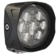
Part Number 0555001 12V LED Work Light with Flood Beam Pattern