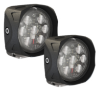
Part Number 0554863 12V LED Work Light Kit with Spot Beam Pattern - Kit of 2