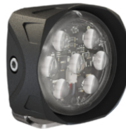
Part Number 0554871 12V LED Work Light with Trapezoid Beam Pattern