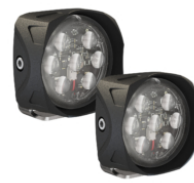
Part Number 0554873 12V LED Work Light Kit with Trapezoid Beam Pattern - Kit of 2