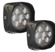
Part Number 0554873 12V LED Work Light Kit with Trapezoid Beam Pattern - Kit of 2