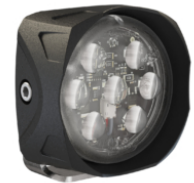
Part Number 0555001 12V LED Work Light with Flood Beam Pattern