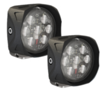
Part Number 0555003 12V LED Work Light Kit with Flood Beam Pattern - Kit of 2