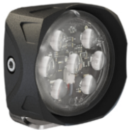
Part Number 0554861 12V LED Work Light with Spot Beam Pattern