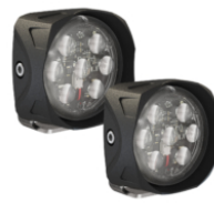
Part Number 0554873 12V LED Work Light Kit with Trapezoid Beam Pattern - Kit of 2