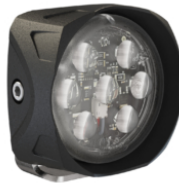
Part Number 0554871 12V LED Work Light with Trapezoid Beam Pattern