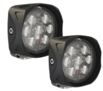
Part Number 0555003 12V LED Work Light Kit with Flood Beam Pattern - Kit of 2