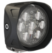
Part Number 0555001 12V LED Work Light with Flood Beam Pattern