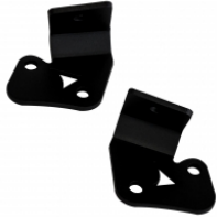
Part Number 6149203 A-Pillar Mounting Kit for Jeep JK