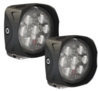
Part Number 0554863 12V LED Work Light Kit with Spot Beam Pattern - Kit of 2