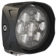
Part Number 0554861 12V LED Work Light with Spot Beam Pattern