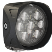
Part Number 0554871 12V LED Work Light with Trapezoid Beam Pattern