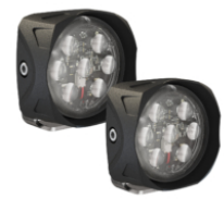
Part Number 0555003 12V LED Work Light Kit with Flood Beam Pattern - Kit of 2