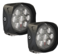
Part Number 0554873 12V LED Work Light Kit with Trapezoid Beam Pattern - Kit of 2