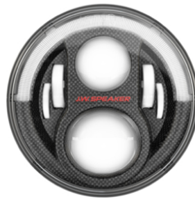
DUAL BURN™ HIGH BEAM