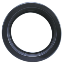
Part Number 4242731 4" Round Rubber Mounting Grommet for Model 234