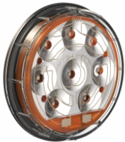
Part Number 0347811 12-24V DOT LED Heated Amber Turn Signal