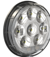
Part Number 0346471 12-24V DOT LED Heated White Reverse Light