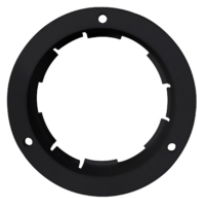
Part Number 5869401 4" Round Plastic Mounting Flange for Model 234