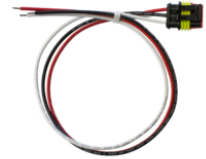
Part Number 3270501 3-Pin AMP Connector Wire Harness Assembly