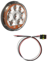
Part Number 0347814 12-24V DOT LED Heated Amber Turn Signal Kit with Harness