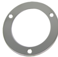
Part Number 8200441 4" Round Stainless Steel Trim Ring for Model 234