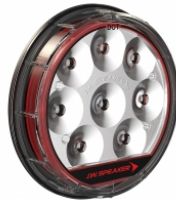
Part Number 0347861 12-24V DOT LED Non- Heated Red Stop, Tail, & Turn Light