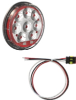
Part Number 0346264 12-24V DOT LED Heated Red Stop, Tail, & Turn Light Kit with Harness