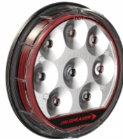
Part Number 0346421 12-48V DOT LED Non- Heated Stop & Tail Light