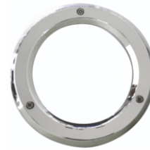
Part Number 8200451 4" Round Chrome Plastic Trim Ring for Model 234