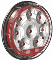
Part Number 0346261 12-24V DOT LED Heated Red Stop, Tail, & Turn Light