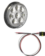
Part Number 0346474 12-24V DOT LED Heated White Reverse Light Kit with Harness