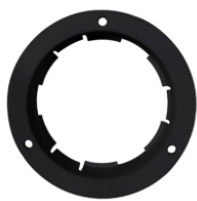
Part Number 5869401 4" Round Plastic Mounting Flange for Model 234