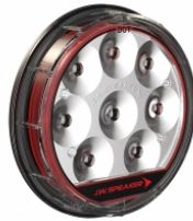
Part Number 0347861 12-24V DOT LED Non- Heated Red Stop, Tail, & Turn Light