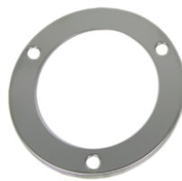
Part Number 8200441 4" Round Stainless Steel Trim Ring for Model 234