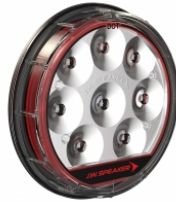
Part Number 0346421 12-48V DOT LED Non- Heated Stop & Tail Light