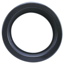
Part Number 4242731 4" Round Rubber Mounting Grommet for Model 234