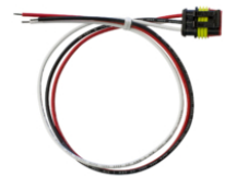
Part Number 3270501 3-Pin AMP Connector Wire Harness Assembly