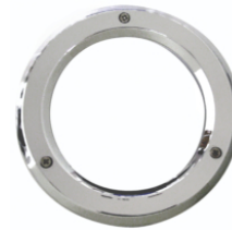
Part Number 8200451 4" Round Chrome Plastic Trim Ring for Model 234