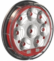
Part Number 0346261 12-24V DOT LED Heated Red Stop, Tail, & Turn Light