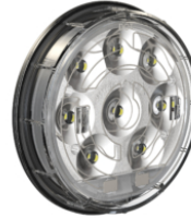
Part Number 0346471 12-24V DOT LED Heated White Reverse Light