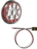
Part Number 0346264 12-24V DOT LED Heated Red Stop, Tail, & Turn Light Kit with Harness