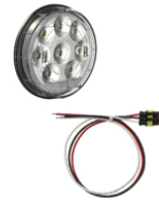
Part Number 0346474 12-24V DOT LED Heated White Reverse Light Kit with Harness