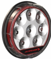
Part Number 0347861 12-24V DOT LED Non- Heated Red Stop, Tail, & Turn Light