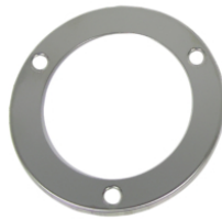
Part Number 8200441 4" Round Stainless Steel Trim Ring for Model 234