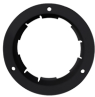
Part Number 5869401 4" Round Plastic Mounting Flange for Model 234