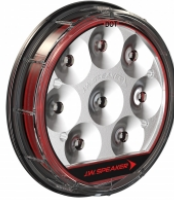
Part Number 0346421 12-48V DOT LED Non- Heated Stop & Tail Light