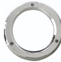
Part Number 8200451 4" Round Chrome Plastic Trim Ring for Model 234