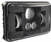
Part Number 0552561 12-24V ECE LED LHT Low Beam Headlight with Black Bezel