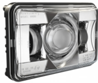
Part Number 0551381 12-24V DOT/ECE LED High Beam Headlight with Chrome Bezel