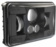
Part Number 0552551 12-24V DOT/ECE LED RHT Low Beam Headlight with Black Bezel