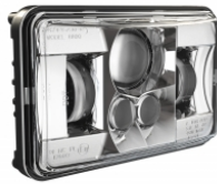
Part Number 0551391 12-24V ECE LED LHT Low Beam Headlight with Chrome Bezel