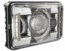
Part Number 0551781 12-24V DOT/ECE LED High Beam Heated Headlight with Chrome Bezel