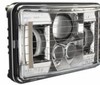
Part Number 0551771 12-24V DOT/ECE LED RHT Low Beam Heated Headlight with Chrome Bezel