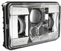
Part Number 0551371 12-24V DOT/ECE LED RHT Low Beam Headlight with Chrome Bezel