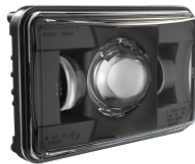
Part Number 0552571 12-24V DOT/ECE LED High Beam Headlight with Black Bezel