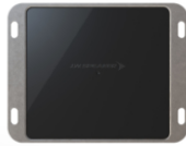
Part Number 0842352 24/48V DC/DC Converter w/ Amp Wiring Connector