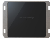
Part Number 0842362 24/48V DC/DC Converter w/ Wiring Connector