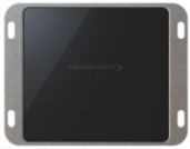
Part Number 0842342 24/48V DC/DC Converter w/ 4-pin Sumitomo Wiring Connector