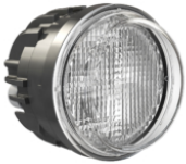
Part Number 0347941 12-24V SAE/ECE LED Turn Signal with DRL Function