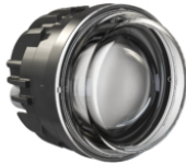
Part Number 0553071 12-24V DOT/ECE LED High Beam Headlight