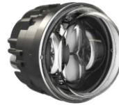
Part Number 0553091 12-24V ECE LHT LED Low Beam Headlight