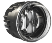
Part Number 0553101 12-24V DOT/ECE RHT LED Low Beam Headlight