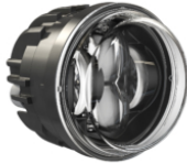
Part Number 0556701 12-24V SAE/ECE LED Fog Light