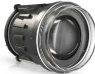
Part Number 0560371 12-24V DOT/ECE RHT LED 5-in-1 Headlight