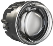
Part Number 0554381 12-24V DOT/ECE LED High Beam Headlight with Front Position