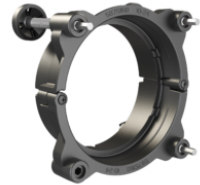
Part Number 8001471 90mm Light 3-Point Mount for 3mm Mounting Frame