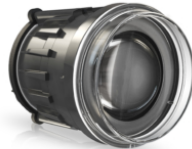
Part Number 0560371 12-24V DOT/ECE RHT LED 5-in-1 Headlight