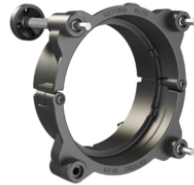
Part Number 8001461 90mm Light 3-Point Mount for 1.5mm Mounting Frame