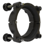
Part Number 8201021 90mm 3-Point Lock Mount for 3mm Mounting Frame