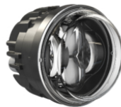
Part Number 0556701 12-24V SAE/ECE LED Fog Light