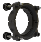
Part Number 8201021 90mm 3-Point Lock Mount for 3mm Mounting Frame