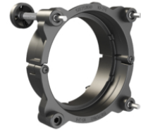
Part Number 8001471 90mm Light 3-Point Mount for 3mm Mounting Frame