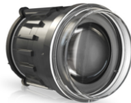
Part Number 0560381 12-24V ECE LHT LED 5-in-1 Headlight