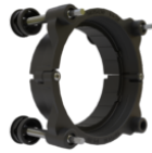
Part Number 8201021 90mm 3-Point Lock Mount for 3mm Mounting Frame