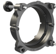
Part Number 8001461 90mm Light 3-Point Mount for 1.5mm Mounting Frame