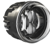
Part Number 0553101 12-24V DOT/ECE RHT LED Low Beam Headlight