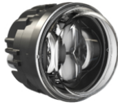
Part Number 0553091 12-24V ECE LHT LED Low Beam Headlight