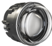
Part Number 0554381 12-24V DOT/ECE LED High Beam Headlight with Front Position