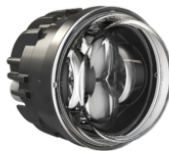
Part Number 0556701 12-24V SAE/ECE LED Fog Light