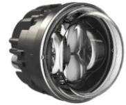
Part Number 0553091 12-24V ECE LHT LED Low Beam Headlight