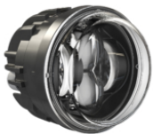
Part Number 0553101 12-24V DOT/ECE RHT LED Low Beam Headlight