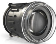
Part Number 0560381 12-24V ECE LHT LED 5-in-1 Headlight