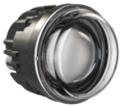
Part Number 0553071 12-24V DOT/ECE LED High Beam Headlight