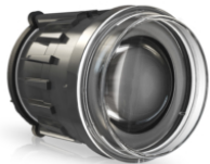
Part Number 0560371 12-24V DOT/ECE RHT LED 5-in-1 Headlight