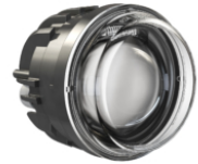
Part Number 0554381 12-24V DOT/ECE LED High Beam Headlight with Front Position