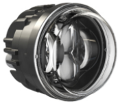
Part Number 0556701 12-24V SAE/ECE LED Fog Light