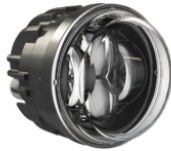
Part Number 0553081 12-24V DOT/ECE Symmetric LED Low Beam Headlight