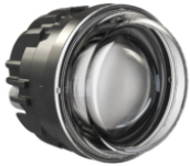
Part Number 0553071 12-24V DOT/ECE LED High Beam Headlight