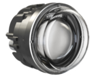
Part Number 0554381 12-24V DOT/ECE LED High Beam Headlight with Front Position