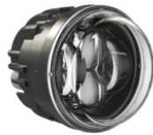
Part Number 0553091 12-24V ECE LHT LED Low Beam Headlight