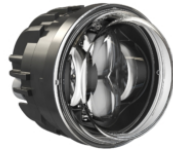
Part Number 0553091 12-24V ECE LHT LED Low Beam Headlight