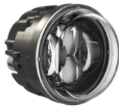
Part Number 0553081 12-24V DOT/ECE Symmetric LED Low Beam Headlight