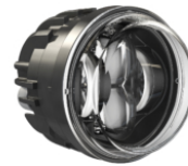
Part Number 0553101 12-24V DOT/ECE RHT LED Low Beam Headlight