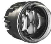
Part Number 0553101 12-24V DOT/ECE RHT LED Low Beam Headlight