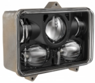
Part Number 0550271 12-24 DOT/ECE LED RHT High & Low Beam Headlight with FP & 3 Point Mount