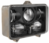
Part Number 0550281 12-24 ECE LED LHT High & Low Beam Headlight with FP & 3 Point Mount