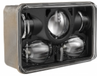
Part Number 0550941 12-24 ECE LED LHT High & Low Beam Headlight with FP & Panel Mount