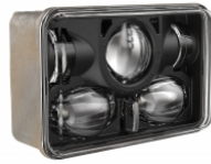
Part Number 0550941 12-24 ECE LED LHT High & Low Beam Headlight with FP & Panel Mount