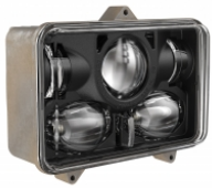
Part Number 0550271 12-24 DOT/ECE LED RHT High & Low Beam Headlight with FP & 3 Point Mount