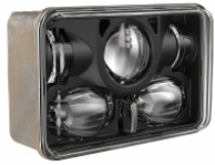
Part Number 0550931 12-24 DOT/ECE LED RHT High & Low Beam Headlight with FP & Panel Mount